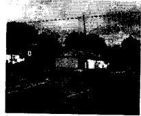
5/27/2020 12:00:00 AM

The primary use of the assessment data is for the preparation of the current year tax roll. No responsibility or liability is assumed for inaccuracies or errors.