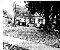
12/21/2023 12:00:00 AM

The primary use of the assessment data is for the preparation of the current year tax roll. No responsibility or liability is assumed for inaccuracies or errors.