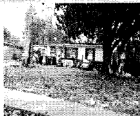
12/21/2023 12:00:00 AM