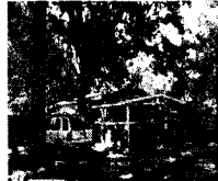
10/19/2017 12:00:00 AM

The primary use of the assessment data is for the preparation of the current year tax roll. No responsibility or liability is assumed for inaccuracies or errors.