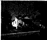
12/19/2013 12:00:00 AM

The primary use of the assessment data is for the preparation of the current year tax roll. No responsibility or liability is assumed for inaccuracies or errors.