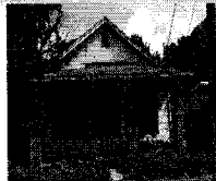
7/24/2023 12:00:00 AM

The primary use of the assessment data is for the preparation of the current year tax roll. No responsibility or liability is assumed for inaccuracies or errors.