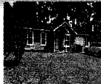
7/14/2021 12:00:00 AM

The primary use of the assessment data is for the preparation of the current year tax roll. No responsibility or liability is assumed for inaccuracies or errors.