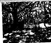
3/14/2023 12:00:00 AM

The primary use of the assessment data is for the preparation of the current year tax roll. No responsibility or liability is assumed for inaccuracies or errors.