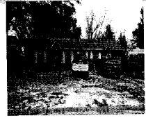
1/24/2024 12:00:00 AM

The primary use of the assessment data is for the preparation of the current year tax roll. No responsibility or liability is assumed for inaccuracies or errors.