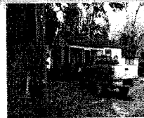
4/20/2021 12:00:00 AM

The primary use of the assessment data is for the preparation of the current year tax roll. No responsibility or liability is assumed for inaccuracies or errors.