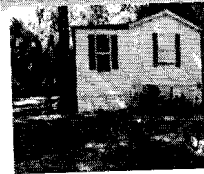
11/21/2019 12:00:00 AM

The primary use of the assessment data is for the preparation of the current year tax roll. No responsibility or liability is assumed for inaccuracies or errors.