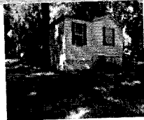
11/21/2019 12:00:00 AM