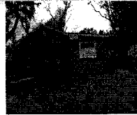
1/12/2021 12:00:00 AM

The primary use of the assessment data is for the preparation of the current year tax roll. No responsibility or liability is assumed for inaccuracies or errors.