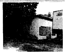
7/14/2021 12:00:00 AM

The primary use of the assessment data is for the preparation of the current year tax roll. No responsibility or liability is assumed for inaccuracies or errors.