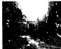
10/25/2022 12:00:00 AM

The primary use of the assessment data is for the preparation of the current year tax roll. No responsibility or liability is assumed for inaccuracies or errors.