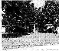
4/27/2022 12:00:00 AM

The primary use of the assessment data is for the preparation of the current year tax roll. No responsibility or liability is assumed for inaccuracies or errors.