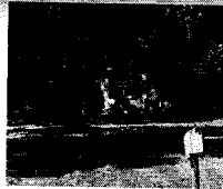
10/23/2019 12:00:00 AM

The primary use of the assessment data is for the preparation of the current year tax roll. No responsibility or liability is assumed for inaccuracies or errors.