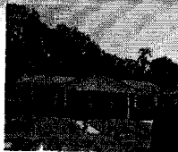
10/1/2018 12:00:00 AM

The primary use of the assessment data is for the preparation of the current year tax roll. No responsibility or liability is assumed for inaccuracies or errors.