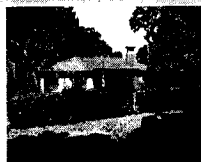
7/8/2019 12:00:00 AM

The primary use of the assessment data is for the preparation of the current year tax roll. No responsibility or liability is assumed for inaccuracies or errors.