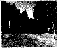
10/30/2023 12:00:00 AM

The primary use of the assessment data is for the preparation of the current year tax roll. No responsibility or liability is assumed for inaccuracies or errors.