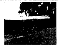
7/15/2019 12:00:00 AM