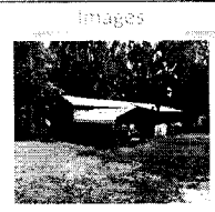
10/22/2020 12:00:00 AM

The primary use of the assessment data is for the preparation of the current year tax roll. No responsibility or liability is assumed for inaccuracies or errors.