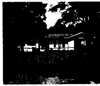
7/29/2022 12:00:00 AM

The primary use of the assessment data is for the preparation of the current year tax roll. No responsibility or liability is assumed for inaccuracies or errors.