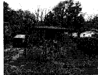
3/7/2018 12:00:00 AM

The primary use of the assessment data is for the preparation of the current year tax roll. No responsibility or liability is assumed for inaccuracies or errors.