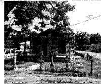
5/16/2018 12:00:00 AM

The primary use of the assessment data is for the preparation of the current year tax roll. No responsibility or liability is assumed for inaccuracies or errors.