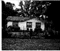
12/3/2009 12:00:00 AM

The primary use of the assessment data is for the preparation of the current year tax roll. No responsibility or liability is assumed for inaccuracies or errors.