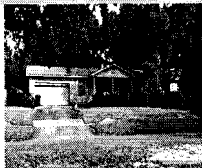
1/30/2019 12:00:00 AM

The primary use of the assessment data is for the preparation of the current year tax roll. No responsibility or liability is assumed for inaccuracies or errors.